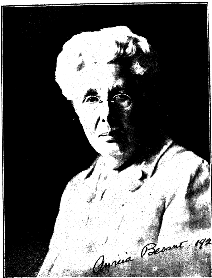
Dr. ANNIE BESANT.

President, Theosophical Society, Adyar, Madras, S.